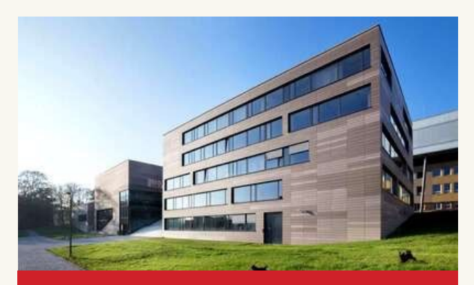
SOCIO-ECONOMIC FACULTY AT PURKYNE UNIVERSITY IN ÚSTÍ NAD LABEM