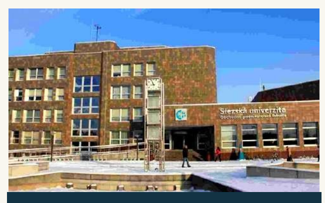
FACULTY OF BUSINESS ADMINISTRATION AT THE UNIVERSITY OF SILESIA IN OPAVA

UNIVERSITY OF FINANCE AND MANAGEMENT | VŠFS (PRIVATE UNIVERSITY)