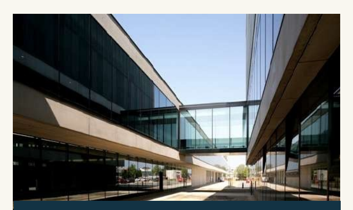
FACULTY OF ECONOMICS AND MANAGEMENT AT THE UNIVERSITY OF PARDUBICE